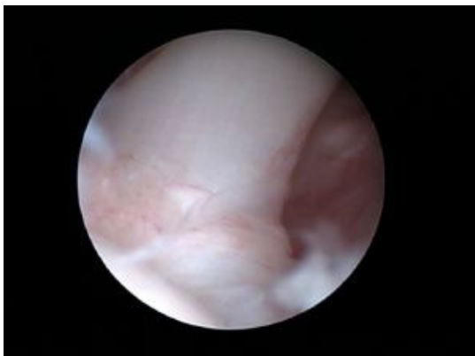
Arthroscopic picture of a biceps tendon

In most cases an arthroscopy is performed to achieve a diagnosis, a simple procedure such as releasing a damaged ligament or removing a chip fracture may be indicated in which case we proceed under the same anaesthetic as the arthroscopy. In more complex cases the specific treatment may involve reconstruction of ligaments or injection of stem cells into damaged muscles. In these cases the treatment will be booked in for another date so that we can liaise with the stem cell lab or arrange for fitting for a supporting brace prior to surgery.